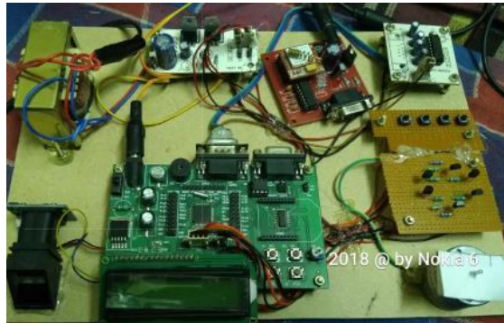
Figure 2: Hardware of the Project

The complete hardware of the task is shown in the determine 2. The exclusive accessories of the task are clearly shown. That is project is inexpensive in fee and very reliable in case of better security. These BIOMETRIC headquartered lockers have many merits over the conventional locking systems which make it more fundamental. That is very convenient to use.