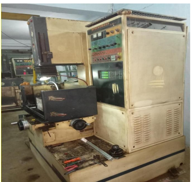
Figure 1 Electrical Discharge Machine experimental set up

The operations are conducted in EDM die sinking machine. Fig1 demonstrates the setup for the EDM machine which is utilized for operation. Die steel is chosen as work piece material which is utilized in making dies, rolls and other mechanical industrial products. The pulse on time, pulse off time, gap voltage and current are considered as input variables. The range of the process variables are selected based on previous literature study. The Copper, Brass and Tungsten-copper alloy electrodes are used as cutting tool for the electro discharge machining of die steel. Total 9 pilot experiments have been conducted to observe the influence of different cutting tool material on material removal rate of EDM of die steel as revealed in Table 1.